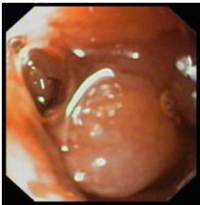
Figure 1 Endoscopic view of submucosal mass lesion in second part of duodenum, with normal glistening mucosa.

Treatment options in a case of RCC metastasis depend upon the extent and location of the lesion. In the majority of reported cases of duodenal metastasis, metastatectomy was done. However for disseminated malignancy like in our case treatment is in the form of palliative (non-curative) surgery, radiotherapy, chemotherapy (Sunitinib) or immune stimulating agents (Interleukin-2). However