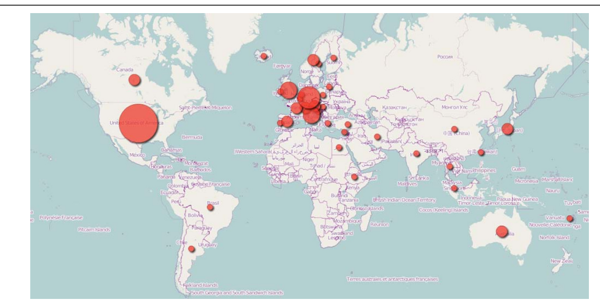
Figure 2 Number of papers per country. Size of circles is correlated to number of papers published.

Finally, also MeSH keyword used to index articles have been examined to understand the topics dealt with by articles. From data presented in Table 3 (where only keywords with more than 50 occurrences have been listed), telepathology has been applied mostly to human pathology, although a number of papers dealt with veterinary applications. Technical topics strongly related to telepathology are image processing, software, interfaces, and networks. The two main applications seems to be remote consultation and frozen sections. There has been many studies related to the quality of the process, expressed in terms of reproducibility, sensitivity and specificity, and interobserver variation.