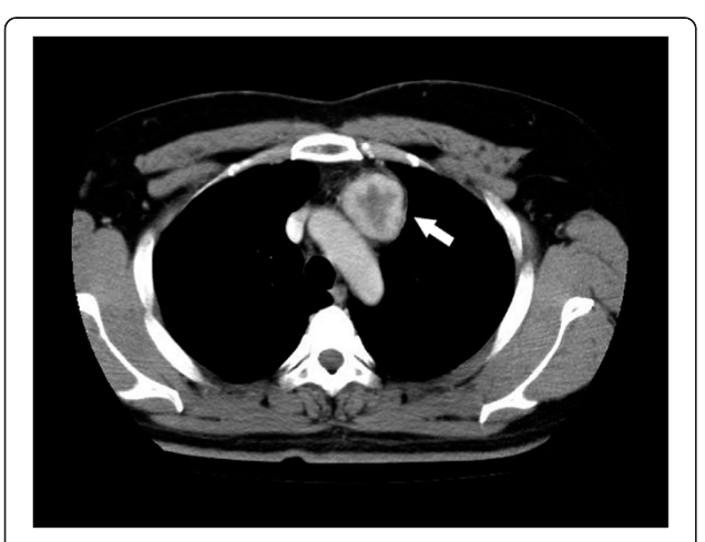
Figure 1 Oral contrast-enhanced CT scanning of the tumor. Oral contrast-enhanced CT revealed a well-circumscribed, solitary mass of 4.41 \times 3.93 cm in the anterior superior mediastinum.

Histologically, the tumor was relatively well-defined. The tumor was predominantly composed of abundant plump spindle cells. The cells were diffusely arranged into solid sheets or whirling patterns with little stroma. The cells had moderate to marked cellular atypia, with pale