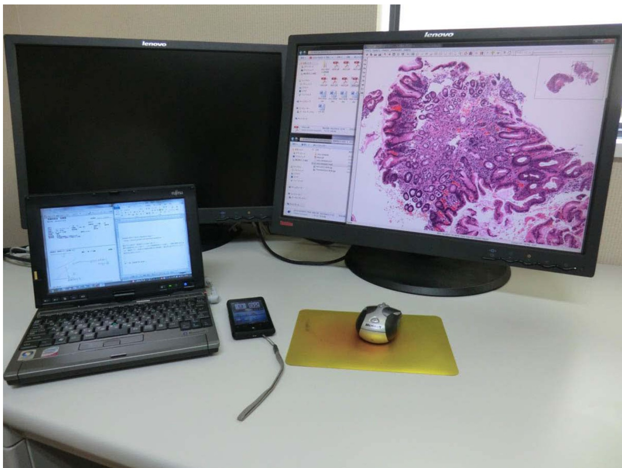
Figure 2 Actual working desk of remote diagnosis Notebook PC was connected to the web through mobile telephone network. Another display is also connected to the notebook PC, and diagnosis was done under dual display condition.