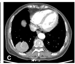
Fig. 1 The chest CT scan manifestation of the tumor. A, In 2018, the tumor was well circumscribed, lobulated, and the maximum diameter was 3.7 cm. B, In 2021, the maximum diameter of the mass was 5.5 cm, with more obvious lobulation. C, Blood vessel was visible in the arterial phase of the tumor