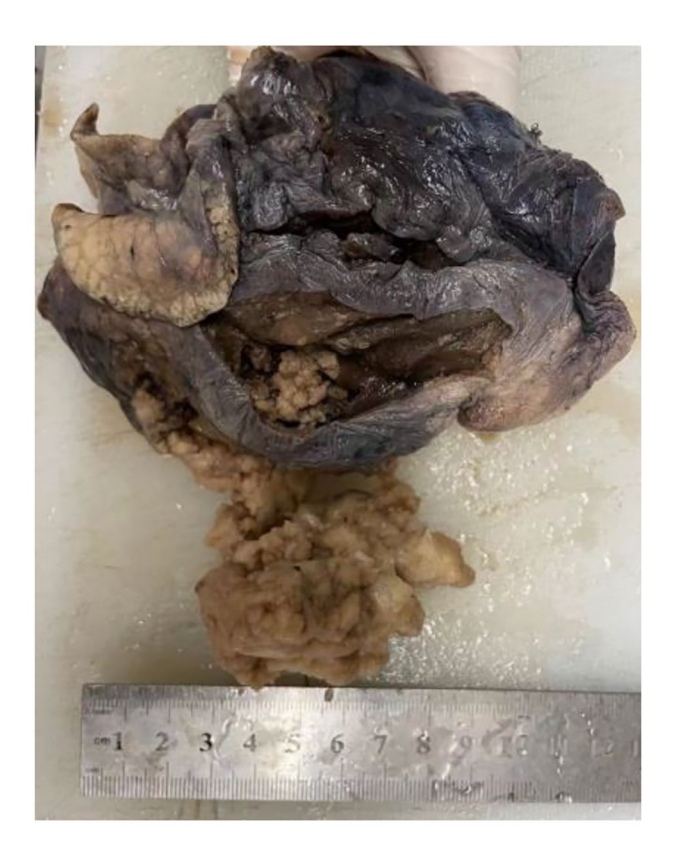
Fig. 2 Grossly, the cut surface of the tumor was gray white, solid and granular, without an envelope, and has a clear boundary with the surrounding lung tissue

did not receive treatment. On May 10, 2021, re-examination of chest CT revealed that the volume of the right lower lobe mass was larger than that in 2018, and the size was about 5.5 cm×5.2 cm×4.2 cm. The mass was well-bounded and lobulated without pleural traction (Fig. 1B). The enhanced scan showed uniform and continuous enhancement of the lesion, and the CT value of each phase was between 75HU and 85HU, and blood vessel was visible in the arterial phase of the tumor (Fig. 1 C). Bilateral hilar and mediastinal structures were clear without enlarged lymph nodes. Peripheral lung cancer was considered in imaging.