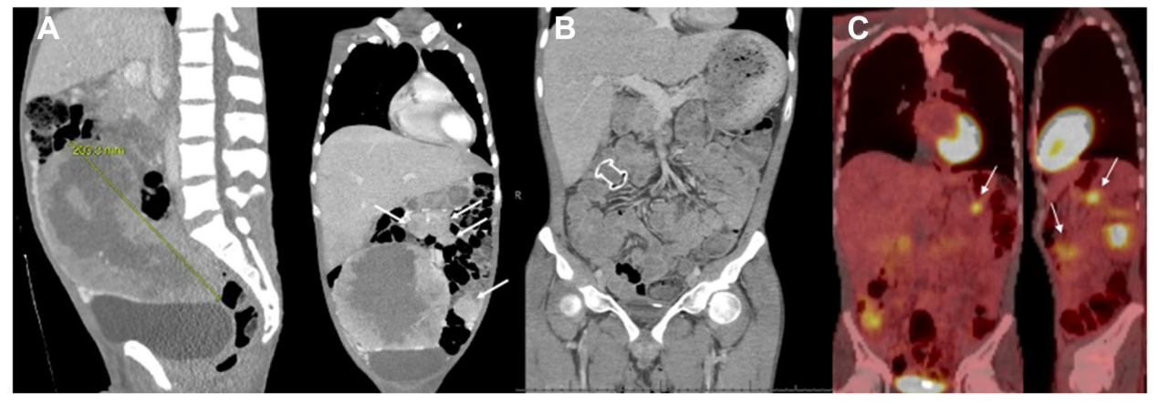
Fig. 2 Radiographic image findings. A Sagittal and coronal CT abdominal images on initial presentation showing a large abdominopelvic mass. White arrows in coronal view highlight metastatic disease in the abdomen. B Coronal CT abdominal post-surgical interventions showing absence of the main mass and the LAMS stent. C Coronal and sagittal PET CT images one month post initiation of nab-sirolimus showing stable residual disease in the abdomen as highlighted by the white arrows

mass, with significant areas of necrosis and hemorrhage. Histologic examination of the specimen demonstrated extensive necrosis and solid, sheet-like proliferation of large epithelioid cells with granular eosinophilic cytoplasm. There was also marked nuclear atypia, with prominent nucleoli, and nuclear pleomorphism (Fig. 1C and D). Brisk mitotic activity (>100 per 50 HPFs) with atypical mitoses were observed.