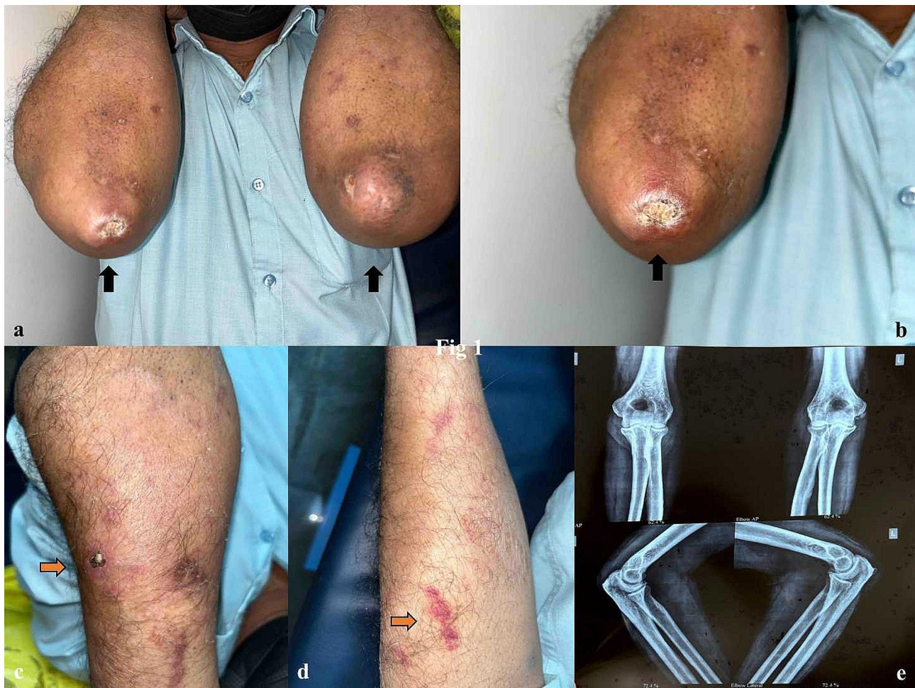
Fig. 1 a,b,c,d: Swelling in the right elbow posterior aspect measuring 2×2 cm, firm to hard and non-tender. Another swelling in the left elbow is firm to hard with overlying reddish skin. There were a few purpuric lesions on the arms with superficial crusting. e: X-ray from B/L elbow shows inflammation with irregular fluid collection into the posterior aspect of the right elbow in the subcutaneous plane and irregular erosion of the olecranon

Fasting sugar- 261 mg/dl, Postprandial sugar- 227 mg/dl, and HbA1c- 8.2%. Lipid profile revealed higher triglycerides values (203 mg/dl), and other parameters were normal. His viral serological markers were negative. Ziehl-Neelsen (ZN) stain for Acid fast bacilli (AFB) in the smear was negative & Catridge based Nuclei acid amplification testing (CB-NAAT) was negative from the sputum sample. With the above findings, the clinical suspicion was of gouty arthritis.