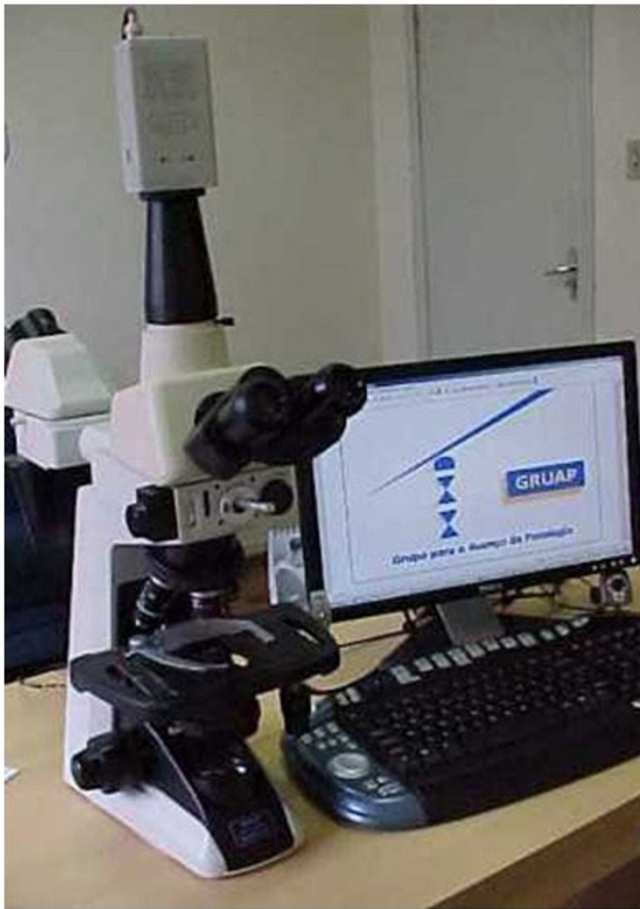
Figure 1 Our telepathology system.