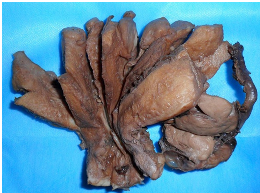
Figure 1 The uterus had 2 myometrial nodules(arrows) and the left broad ligament had a lobulated nodule (star). No hemorrhage, necrosis or infiltrative features were seen in the uterine corpus, ovary, or fallopian tube.

Other specimens revealed chronic cervicitis, endometrium of proliferative phase, follicular cyst of left ovary,