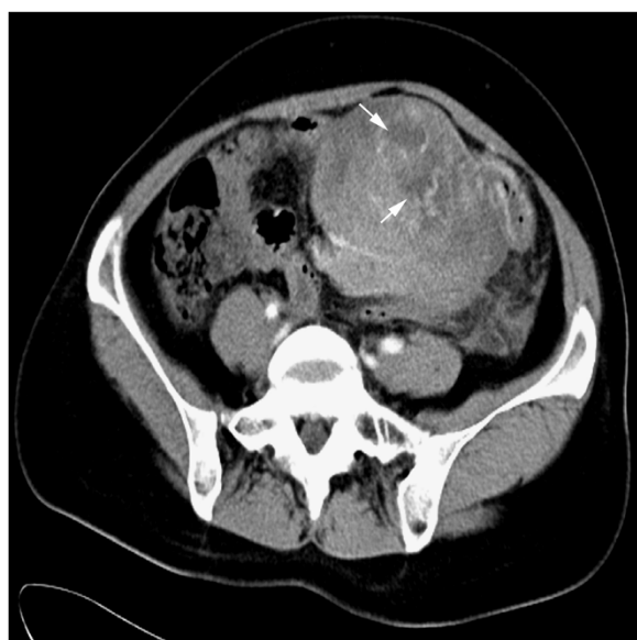
Figure 1 Preoperative computed tomography (CT) scan of the mesenteric mass. Contrast-enhanced CT demonstrating a poorly circumscribed solid mass with mild heterogeneous enhancement located at mesentery and showed adhesions of wall of jejunum. The multiple irregular hypointensity areas were observed in the mass and considered to be necrotic areas (white arrow).

A 38-year-old female patient presented with complaints of abdominal pain and abdominal distension that had persisted 3 days before admission to our hospital. Physical examination showed local tenderness and rebounding pain in the left abdominal region, and decreased bowel sounds. The laboratory results, including blood count, differential, liver and renal function, were within the normal range. There was no fever, weight loss and no palpable lymphadenopathy or organomegaly. A computed tomography (CT) scan showed a poorly circumscribed solid mass (9.9 cm × 8.6 cm × 7.1 cm) with mild heterogeneous enhancement located in the left upper abdominal region with adhesions of wall of jejunum. There was hypointensity areas observed in the mass after gadolinium injection (Figure 1). A preoperative presumed diagnosis was extra-gastrointestinal stromal tumor of abdomen. The patient underwent tumor resection and segmental resection of the jejunum. At surgery, the mass was located at the mesentery of the small bowel and a part of the mass was observed to extend to the wall of jejunum. The mass was removed totally, and the postoperative phase was uneventful. Since there was a possibility of tumor metastasis to another anatomical location, the patient was referred to a whole body positron emission tomography (PET)/CT study to search for the potentially secondary tumor, but no abnormality was found. After diagnosis, the patient