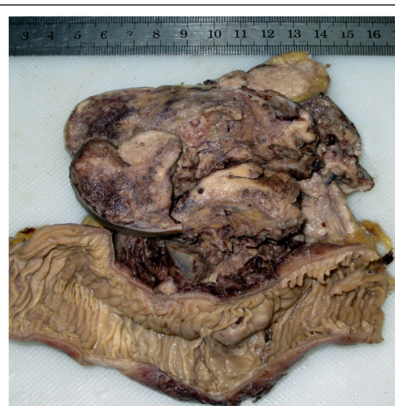
Figure 2 Gross examination of resected mesenteric mass. The mass was gray-tan solitary nodular mass without a fibrous capsule. The mass was observed to extend to the wall of jejunum and necrotic areas were also found.

Under microscopic examination, a part of the tumor was surrounded by a thin fibrous pseudocapsule at the periphery. The tumor was composed of cells with abundant clear to fine eosinophilic granular cytoplasm and round,